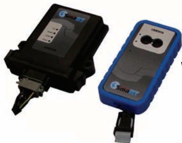
Wireless Remote 2 or 4 button