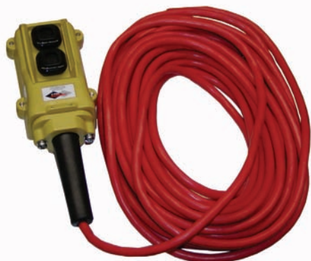
Wired Remote 2 or 4 button