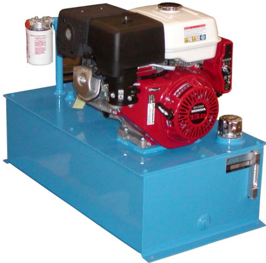
Model HP 13E